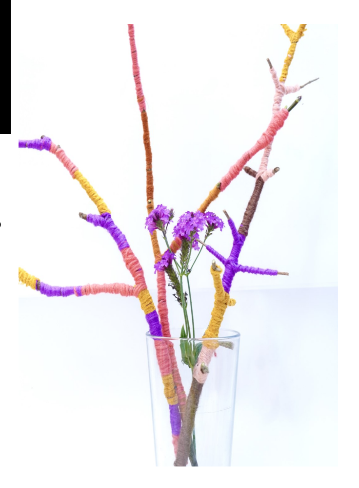
Yarn wrapped twigs in vase-photo by the artist